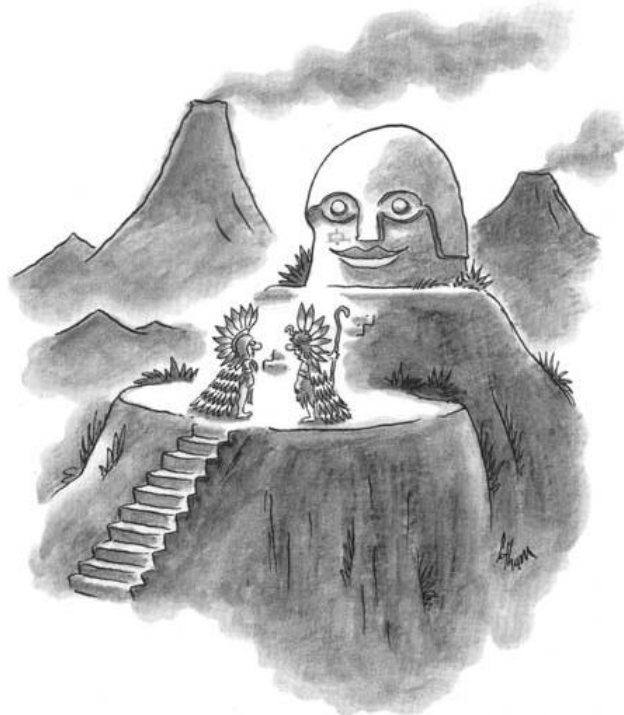
"He's good with crops but slow to respond in an emergency."

The success in Egypt and Niger is the result of intense efforts in 2004-05 to halt Africa's polio epidemic and fast-track the introduction of monovalent polio vaccines into selected ar-