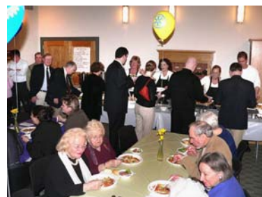
Scene from last year's auction

Any of our members /and or supporters of our Rotary Club, knowing the work that we do in our community, are urged to consider an item or two to pledge for our upcoming auction April 2nd.