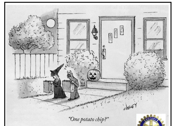
"One potato chip?"