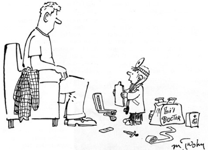
"Because of your age, I'm going to recommend doing nothing."

For the complete report, look on the Rotary International website.