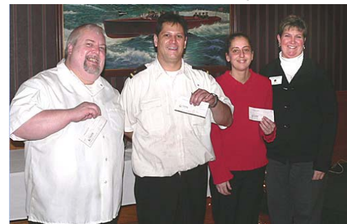
Rotary checks to our great Porthole Staff, too!