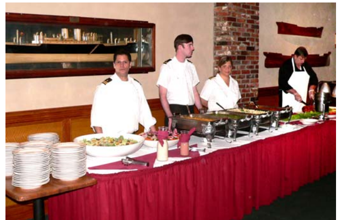
The PortHole gang was able and ready with a delicious luncheon, so good that many went back for seconds !!

Are YOU considering increasing your donations to our Rotary Foundation this year ?