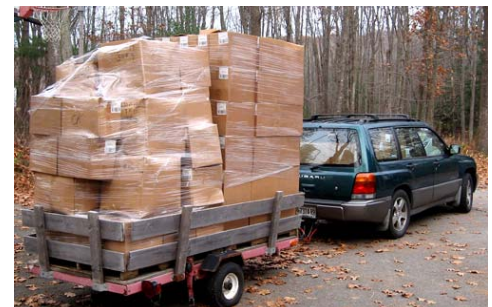
See what 2,000 sneakers can look like ?

We will have about 25 students with us on that trip; each student will have an extra duffel bag filled with sneakers! It will be a huge improvement for the local villagers."