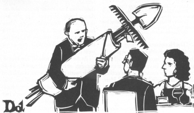
"Who had the garden salad?"

Are YOU considering making a donation to our Rotary Foundation this year ?