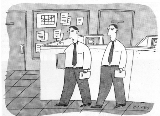
"My instincts tell me to call an emergency board meeting. My emotions tell me to barve it at the all-nude bar across the street."