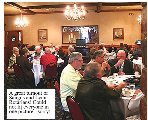
A great turnout of Saugus and Lynn Rotarians! Could not fit everyone in one picture - sorry!

100% and we were flabbergasted at our inability!