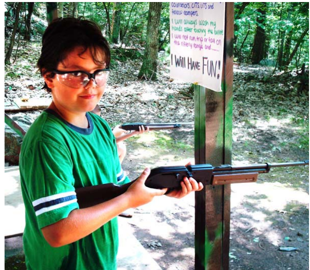
At Camp Rotary, youngsters learn riflery safely and love it!